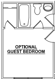
Optional Guest Bedroom in Lieu of Study